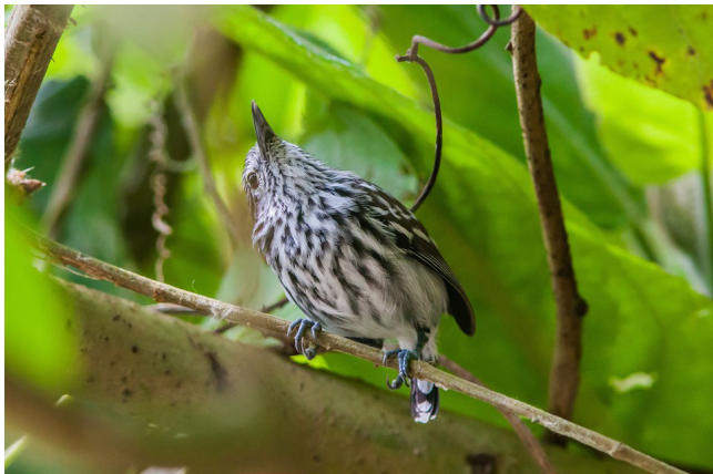
FIGURE 6. Klages's Antwren ( Myrmotherula klagesi ) at an unnamed island in the Rio Branco (T.O.L.)

which it relies, and will likely have negative consequences for the Rio Branco populations of this species.