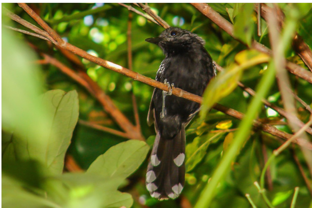
FIGURE 7. Rio Branco Antbird ( Cercomacra carbonaria ) at Ilha do Palhal in the Rio Branco (T.O.L.)

The Rio Branco Antbird (Figure 7) is a range-restricted Rio Branco near-endemic, which is currently considered Critically Endangered (Vale et al. 2007; BirdLife International 2014). We commonly recorded this antbird on river islands and more rarely along the margins of the Rio Branco, from Vista Alegre to the Rio Anauá. Previous records extended its known distribution more than 300 km southward (Naka et al. 2007). Although it is relatively common in suitable habitat, habitat modifications