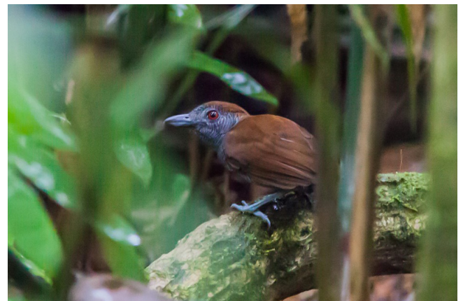
FIGURE 5. Black-throated Antshrike ( Frederickena viridis ) around the Serra do Viruá (T.O.L.)

The Black-throated Antshrike (Figure 5) is a relatively uncommon understory Guianan endemic, that until recently was only known from a single record for the entire state of Roraima (Naka et al. 2006). In 2007, we recorded a male in a terra-firme forest at ~7 km from the park's boundaries (1°39'20"N, 61°2'14"W), but in December 2012 and August 2013, we voice-recorded and photographed a female in the terra-firme forest along the Buritizal Trail, near the park headquarters, and in February 2014 we found another individual at the Estrada do Neri. These are the only records of this species in VNP, and the third known locality for Roraima.