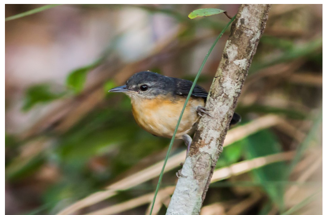
FIGURE 8. Yapacana Antbird ( Aprositornis disjuncta ) in the campinaranas around the Estrada Perdida (T.O.L.)

This range-restricted, monotypic antbird (Figure 8) is known from a handful of localities in northern Amazonia (Zimmer & Isler 2003). We first recorded this campina specialist in VNP in May 2001, and it has been recorded regularly in different localities along the Estrada Perdida and near the Rio Anauá ever since. VNP remains the only known locality of this taxon in Roraima, and only the second Brazilian site.