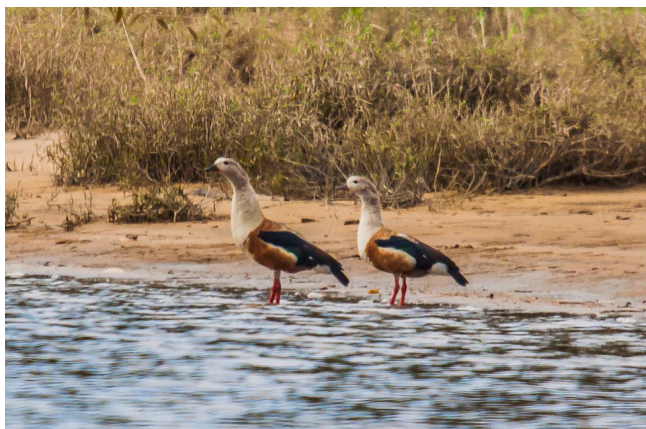
FIGURE 2. Orinoco Goose ( Neochen jubata ) at Ilha do Palhal in the Rio Branco (T.O.L.).

The Orinoco Goose (Figure 2) is a widespread but poorly known species regularly seen on sandy beaches along the Rio Branco. Although this species is known to perform seasonal movements, at least in part of its distribution in southern Amazonia (Davenport et al. 2012), very little is known about this species at VNP, or along the entire