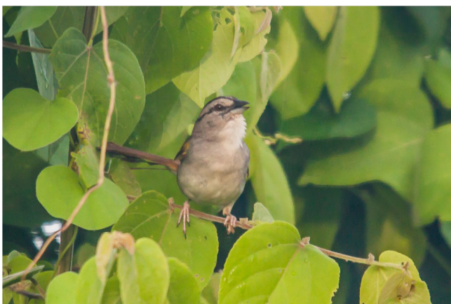
FIGURE 9. Black-striped Sparrow ( Arremonops conirostris ) at Ilha do Aliança in the Rio Branco (T.O.L.)

Although this species (Figure 9) is widespread in northern South America and southern Central America, the state of Roraima represents the only known area of occurrence in Brazil. We recorded this species in VNP during our surveys in early successional vegetation on islands along the Rio Branco. The population in Roraima seems to represent the nominate form, which is isolated from the main distribution of the species in northern South America (Hilty 2003).