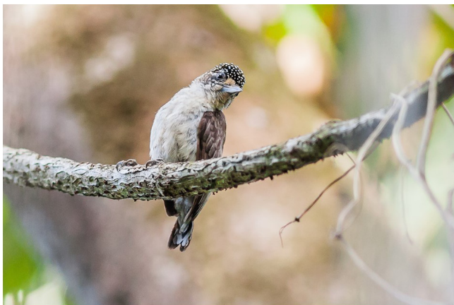
FIGURE 4. White-bellied Piculet ( Picumnus spilogaster) at Ilha do Ajarani in the Rio Branco