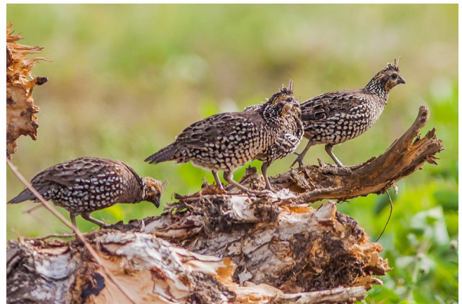
FIGURE 3. Crested Bobwhite ( Colinus cristatus ) at a human-altered area near the Estrada Perdida (T.O.L.).

The Crested Bobwhite (Figure 3) occurs in northern South America in arid lowlands and locally into the subtropical zone, using thickets, woodland edges, savannas, roadsides, and embankments (Carroll & Boesman 2013). It is generally considered more common in open savannas, and its presence on sandy-soiled campinas is poorly documented. We frequently recorded this species in the campinas along the Estrada Perdida and Rio Anauá. VNP seems to represent its southernmost area of occurrence in Roraima.